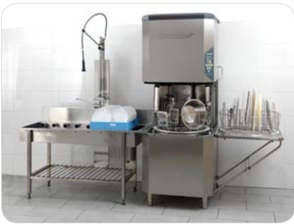
Against a wall