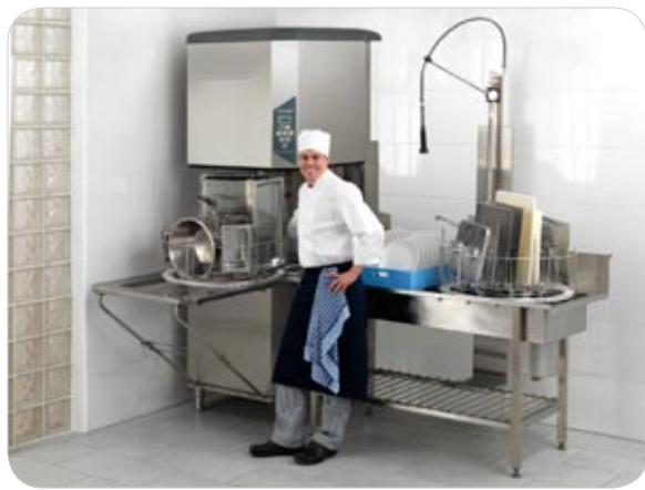
In a corner